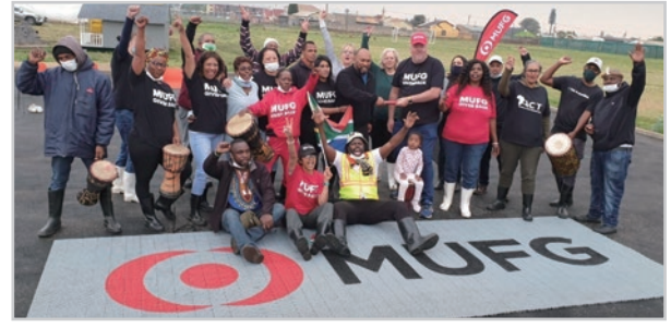
MUFG Johannesburg Representative Office colleagues at the start of Fitprints for Good