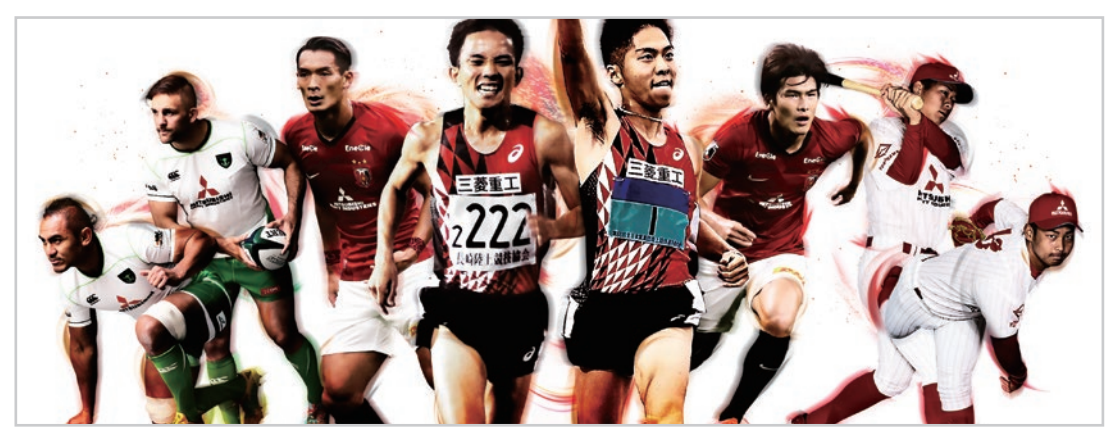
Collage of MHI corporate sports activities

Mitsubishi Heavy Industries (MHI) Group is the main sponsor of a popular professional soccer team in Japan "Urawa Red Diamonds" (Urawa Reds). Also, Japanese companies have traditionally supported amateur sports by running their own sports teams or being sponsors, and MHI as well runs baseball, rugby and marathon teams under the catchword "Mitsubishi Heavy Industries Sports Challenge." By supporting these sports teams including Urawa Reds and accelerating their successful performance, MHI aims at enhancing the following: employee engagement, contributing to society, and enhancing its corporate brand. On January 1 this year, MHI's marathon team took part in the annual New Year Ekiden (long-distance relay race) in Japan and finished sixth to the cheers of their supporters and marathon fans.