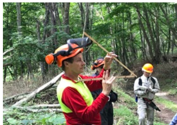
The company makes reference to and borrows from Swiss “close-to-nature” silviculture methods and invites Swiss foresters to Japan to participate in its forestry management.