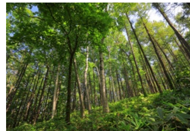
Teine Forest in Sapporo City, Hokkaido. The company makes part of the forest, with its nature trails and camping sites, available to those living in Sapporo City.

For more information about the Mitsubishi companies, see “mitsubishi.com”