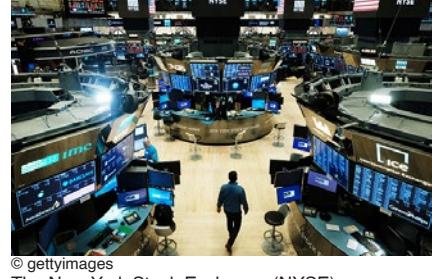
The New York Stock Exchange (NYSE)

New York City is a major influencer in world culture and entertainment. It is home to many performing arts venues including Broadway, Carnegie Hall and Lincoln Center, and museums including the Metropolitan Museum of Art