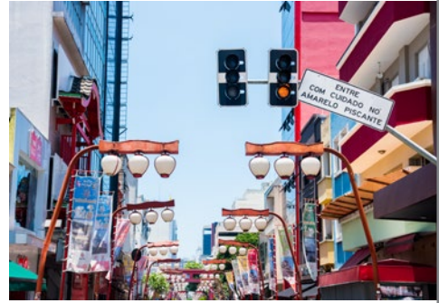
Liberdade offers close contact with Japanese culture

Brazil is famous for its natural beauty, carnival, and soccer. Of course, we all love those things, but there is much more to know. Brazil is the largest country and the biggest economy in Latin America, as well as the world's largest country with Portuguese as its official language and one of the most multicultural and ethnically diverse societies anywhere. Although one of our most famous cities in Brazil is Rio de Janeiro, São Paulo is where everything happens: It has the largest GDP in Latin America and is the most populous city in Brazil, with 12 million people. Folks from all over the world came to work and build a life in São Paulo, with the result that around 1.5 million Japanese descendants live here, creating the biggest Japanese community in the world outside Japan. The neighborhood of Liberdade is famous for its food, shops, and culture, and is a little piece of Japan in São Paulo.