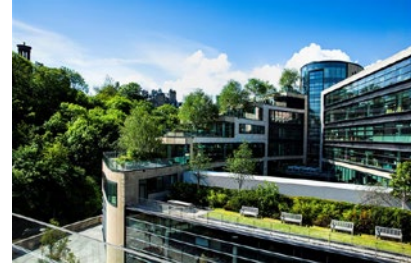
Baillie Gifford offices

MUBGAM is a joint venture between Mitsubishi UFJ Trust & Banking and Baillie Gifford, a UK based investment manager. The origins of the joint venture stretch back to 1989 with Toyo Trust, providing advice on overseas investment portfolios. Underlying investors include many of Japan's largest public and corporate pension funds which wish to have exposure to overseas assets, such as global equities.