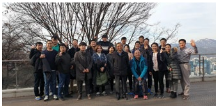
The NBK staff at Namsan Park

NBK is a shipping company providing marine transportation to carry raw materials like coal and iron ore with very big ships. In particular, the Capesize (150,000~200,000 dwt ton) and Panama-size (74,000~95,000 dwt ton) ships are our main assets. We transport cargo mainly from Australia, Indonesia, South Africa, Canada, USA, and Russia to Korea. Our customers are purely Korean companies such as Korean power companies and steel mill companies. All NBK staff are very bright and nice and we love to have dinner and drinks together after work, which is very typical Korean social culture. So far business has been expanding and performing smoothly and successfully through all the employees' efforts and contribution. My primary role is as a managing director of NYK Bulkship Korea, with oversight of the wholesale and marketing and ship management/operation. Personally, I love to travel abroad with my family every year. And I love to play golf and watch movies, especially any of the Sherlock Holmes series, the best of which star Benedict Cumberbatch.