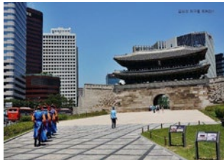
Namdaemun (South Gate)

Last but not the least, shopping should be counted in Seoul too. Just a 10-minute walk from the Namsan Park