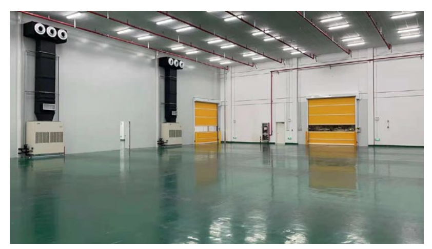
The temperature-controlled space at the Qingpu Sales Office, located close to the Chonggu exit of the G1503 Shanghai Ring Expressway

Shanghai Linghua Logistics, Mitsubishi Logistics' local subsidiary in China, has introduced a temperature-controlled area at its Qingpu warehouse facility. This meets the storage needs for raw materials, semiconductors, medical equipment and other items that need to be kept under temperature-controlled conditions. The company has plans to further invest in temperature-controlled areas in its other warehouses in China. The Mitsubishi Logistics' group network covers major cities throughout China and offers efficient and high-quality logistics services, including import/export forwarding, NVOCC, project cargo transportation, air cargo transportation, bonded logistics, and consolidation.