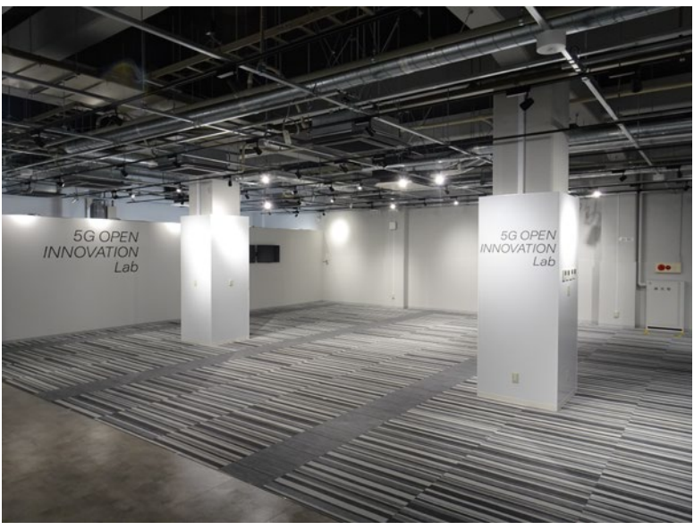
Further market expansion is expected with the opening of the 5G OPEN INNOVATION LAB™, which will provide an environment for the use of local 5G-based solutions.

Mitsubishi Electric was recently licensed by the Ministry of Internal Affairs and Communications (MIC) to operate local 5G mobile communications, and on June 30 it established the 5G OPEN INNOVATION LAB™ at the company's Information Technology R&D Center in Kamakura. The MIC sanctioned the private use of local 5G systems by enterprises and municipalities in December 2019, and then added to this the sub-6 GHz band (4.6 GHz-4.9 GHz) for the construction of high-convenience wide-area local 5G systems in December 2020. The company will collaborate with customers and partner companies in research and demonstrations using 4.8 GHz to 4.9 GHz frequencies in the sub-6 band with the aim of creating new business opportunities and services. This will enable verification comparisons with Wi-Fi 6, private LTE and other wireless systems.