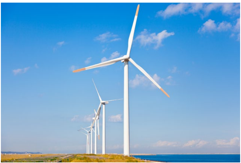
MXDA applications will further expand to the repair of wind turbine blades.

Mitsubishi Gas Chemical (MGC) will be constructing a new plant in an industrial estate in Rotterdam through its newly established and fully funded subsidiary MGC Specialty Chemicals Netherlands B.V. to increase its production capacity of Meta-xylenediamine (MXDA), for which Europe is the largest market. MXDA is mainly used in epoxy coatings for infrastructure applications due to its excellent anticorrosive and chemical-resistant properties, and a long-term growth in the market is expected. In addition to its current applications, the market for MXDA in the repair of wind turbine blades is growing and the new plant is scheduled to start operation in mid-2024. With the establishment of this new manufacturing subsidiary, the MGC Group will be able to strengthen its business continuity plan and ensure the stable supply of MXDA worldwide.