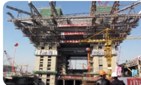
China Pavilion under construction

The China pavilion is designed with the concept of “Oriental Crown.” Introducing traditional wooden structure element . Its main color is “Gugong Red” also named “Forbidden City Red”, which represents the taste and spirit of Chinese culture. The China pavilion consists of Chinese national pavilion, the regional joint pavilion, and the pavilion of Hong Kong, Macao, Taiwan.