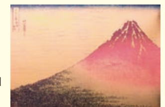
Fine Gold card

Such craftsmanship gives birth to a novel concept, and offers affluence to people.