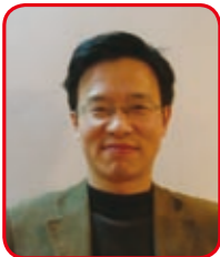
Mitsubishi Chemical China Commerce Limited