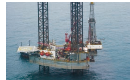
Loche East Marine field

■ http://www.mitsubishicorp.com/en/pdf/pr/mcpr090126ne.pdf