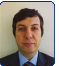
Istanbul Liaison Office Mitsubishi Heavy Industries, Ltd.