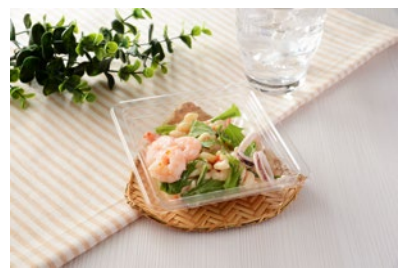
A touch of cheese sauce adds richness to this shrimp and calamari with mentaiko salad. Part of the small-portion "Local Specialty Deli" series