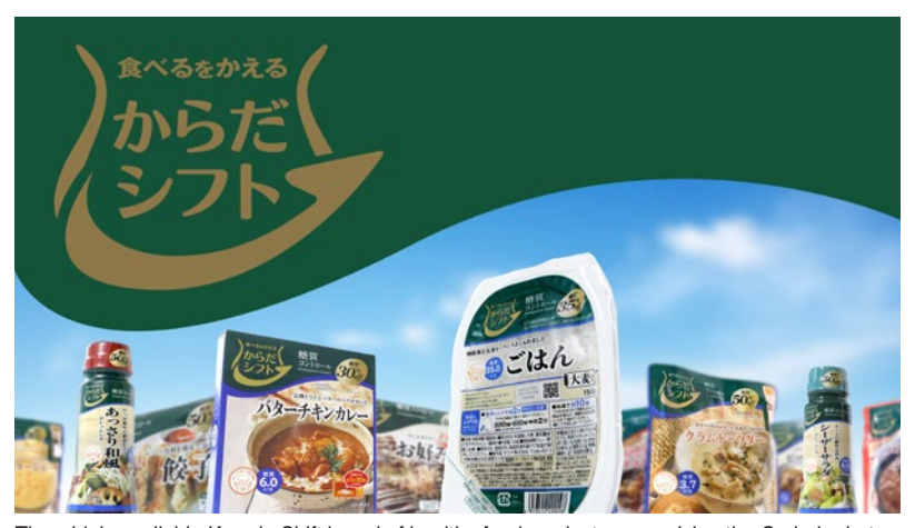
The widely available Karada Shift brand of healthy food products, comprising the Carbohydrate Control and the Protein series, has 61 items in its lineup.

Mitsubishi Shokuhin (MS), conscious of its responsibility to contribute to society through its food products, established the Taberu o kaeru Karada Shift master brand of healthy foods in September 2017. With the government urging the Japanese people to stay healthier for longer through improvements to their diet, we are moving to an age in which, shifting the emphasis from cure to prevention in terms of lifestyle-related illnesses, individuals will manage their health by themselves. On the premise of "Tasty = Sustainable," the company offers a richly varied lineup of 61 food products that embrace the themes of Carbohydrate Control and Protein. This year the company has added 13 new items, both frozen and non-refrigerated, to its Carbohydrate Control series.