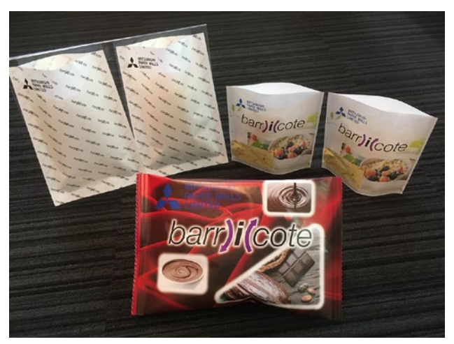
Responding to the diversification in packaging needs in Japan and Asia, the company offers a wide variety of products including high oxygen and water vapor barrier film.

Mitsubishi Paper Mills (MPM) started sales of alternative paper materials that help reduce plastic waste in May 2020. The barricote® brand of coated packaging paper (Forest Stewardship Council® certified; FSC® C021528) has excellent green credentials, having paper's natural biodegradability and recyclability, and does away with the need for plastic film lamination. Mitsubishi HiTec Paper Europe GmbH, a MPM group company, commercialized the barricote® brand, and major European food manufacturers started using it in early 2019. The new barrisherpa® brand, meanwhile, is a coated packaging paper/plastic film laminate which retains the strength and heat sealability of current plastic packaging film products while reducing the amount of plastic used. It can also be blended with plant-based biodegradable plastic film.