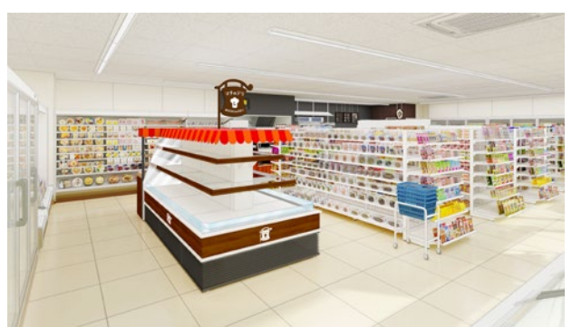
Matching the store to its locality. Thought has also gone into fittings and how the foods are displayed.

Since the spread of COVID-19, there has been a growing need for ready-to-eat meals, as people tire of cooking at home and the government urges people to stay home. A recent survey by Lawson reveals that as food tastes become more personalized, even within families and especially for women, there is a growing preference for favorite foods sold in small portions. Responding to this, Lawson has launched the "Local Specialty Deli" series of 11 new small-portion meals, most featuring colorful salads. The company has also added five new small-portion items to its fried food series. Colorfully bedecked counters selling only these small-portion foods have been installed in stores, making for an easy-choice and fun shopping experience.