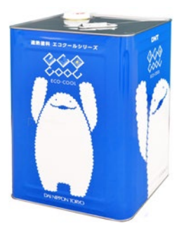
The lineup contains fluorine, silicon and urethane resin products in a wide range of colors.