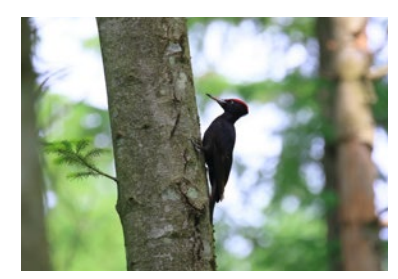
Japan's largest woodpecker, this Black Woodpecker is an endangered species.

Mitsubishi Materials (MMC) currently owns around 14,000 hectares of forestland in Japan. The company originally began acquiring forests for the purpose of supplying wooden supports for its own mines and coal mining activities. Currently, under the slogan "Materials' forests leading the way for forests throughout Japan", the company is managing these forests for the purpose of harnessing their ecosystem services to a high degree. Those services include not only the production of lumber as a renewable resource but also the provision of public recreational spaces, the prevention of global warming through carbon capture and fixation, and biodiversity conservation. The company divides its forests into four categories (zones) depending on their location, topography, growth potential, need for conservation and other features so as to maximize the functions they are expected to fulfill. The company will continue to contribute to a decarbonized society, a recycling-oriented society, local communities, and the conservation of biodiversity through appropriate forest management and effective utilization.