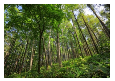
Teine Forest in Sapporo City, Hokkaido. The company makes part of the forest, with its nature trails and camping sites, available to those living in Sapporo City.