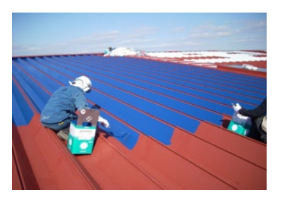
The use of different undercoats allows ECO-COOL to be used on everything from metallic to inorganic surfaces.