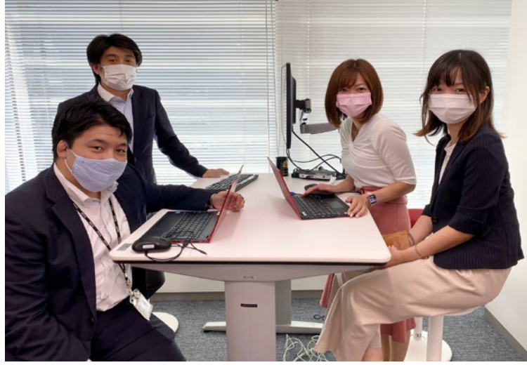
MUFG Carbon Neutral Project Team members (Photo from August 2021)

Mitsubishi UFJ Financial Group (MUFG) announced a "MUFG Carbon Neutrality Declaration" in May 2021. In the following month, MUFG was elected as a member of the Steering Group in the Net Zero Banking Alliance (NZBA), which consists of 12 banks from different regions around the world. Launched in April 2021 with 43 founding banks, NZBA is an alliance convened by the United Nations Environment Program Finance Initiative as part of the Glasgow Financial Alliance for Net Zero. NZBA aims to achieve net zero greenhouse gas (GHG) emissions from financed portfolios by 2050. MUFG has also joined the Partnership for Carbon Accounting Financials (PCAF), which was established in 2015 as a global initiative with the objective of standardizing the measurement and disclosure of financed GHG emissions. PCAF has now expanded to more than 140 financial institutions across 44 countries.