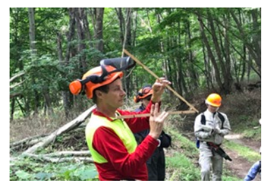
The company makes reference to and borrows from Swiss "close-to-nature" silviculture methods and invites Swiss foresters to Japan to participate in its forestry management.