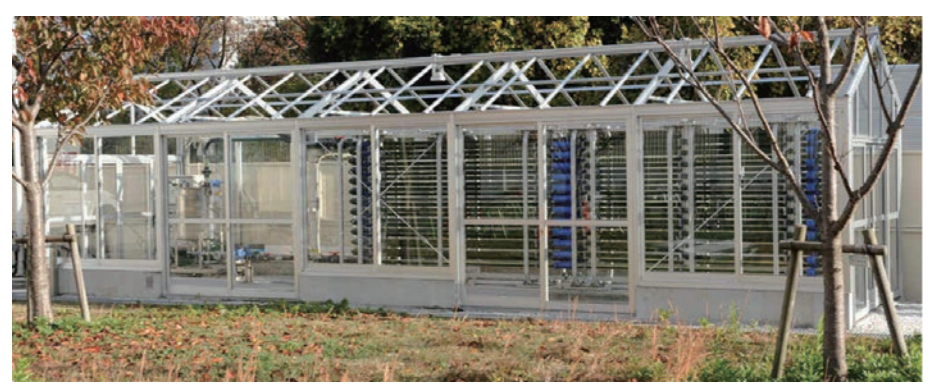
MKK's photobioreactor features an original reactor frame with seismic isolation structure (patent pending) to minimize damage by vibration as well as flying objects as countermeasures against large earthquakes and typhoons.

Mitsubishi Kakoki Kaisha (MKK) has started a demonstration operation of microalgae-culturing production on the premises of their Kawasaki Works, Japan. MKK has been involved in culture technology related to microalgae such as chlorella since the 1980s. One of their main products, the centrifugal disc separator "Mitsubishi Disc Separator", is also being used for research on biojet fuels using microalgae oil and so on in recent years. This time, the demonstration operation is being expected to accelerate their development of microalgae-culturing production processes, new equipment and devices suitable for urban areas, furthermore inside Japan and in Southeast Asia by using fresh microalgae biomass.