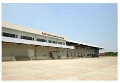
P.T. Mitsubishi Logistics Indonesia

I work at P.T. Mitsubishi Logistics Indonesia, and our office and distribution facility are located in the MM2100 Industrial Town Bekasi, West Java, 25 kilometers to the east of Jakarta. I work as the sales manager and my job includes managing and directing