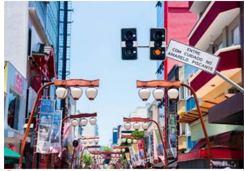
Liberdade offers close contact with Japanese culture

Brazil is famous for its natural beauty, carnival, and soccer. Of course, we all love those things, but there is much more to know. Brazil is the largest country and the biggest economy in Latin America, as well as the world's largest country with Portuguese as its official language and one of the most multicultural and ethnically diverse societies anywhere. Although one of our most famous cities in Brazil is Rio de Janeiro, São Paulo is where everything happens: It has the largest GDP in Latin America and is the most populous city in Brazil, with 12 million people. Folks from all over the world came to work and build a life in São Paulo, with the result that around 1.5 million Japanese descendants live here, creating the biggest Japanese community in the world outside Japan. The neighborhood of Liberdade is famous for its food, shops, and culture, and is a little piece of Japan in São Paulo.