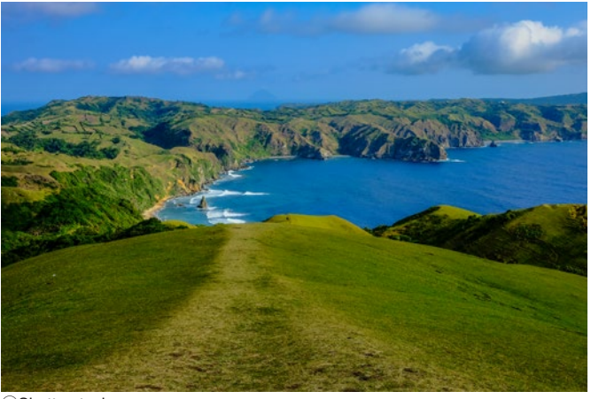
Rolling hills and sublimely beautiful seascapes stretch to the horizon

Wow Philippines! The Philippines has over 7,000 islands and is the perfect getaway to experience a mix of nature, culture, and fun. If tropical islands, beautiful landscapes, and unending adventure are on your bucket list for a holiday trip, then you have found a gem of a destination in the Philippines. The Batanes group of islands is one of the most beautiful destinations in the Philippines and has a little bit of everything for different types of travelers: the mountains, the sea, the rolling hills, and the food. But above all, Batanes offers a unique type of refuge - peace and quiet, and the taste of a back-to-basics lifestyle. Batanes, called the Home of the Winds, is considered the smallest province in the Philippines, with only 230 kilometers of total land area. A trip to Batanes is a welcome escape from the hustle and bustle of city living. The name Batanes derives from the word Batan, the local word for the Ivatan people. Batanes is the perfect place to unwind and enjoy the wonders of nature. It's a magical, almost surreal place to go if you want to get away from your busy daily life.