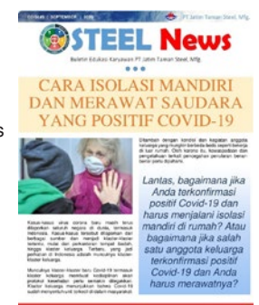
Steel News carries news about COVID-19.

For more information about the Mitsubishi companies, see "mitsubishi.com"