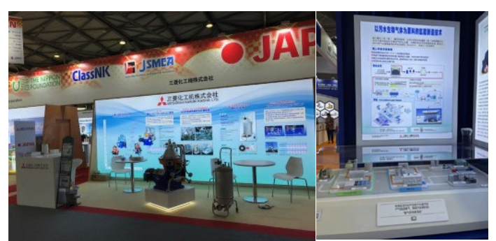
Making the most of exhibitions

Chinese industry has advanced by leaps and bounds in recent years, the national policy and government direction changing rapidly. Accordingly, there are many kinds of exhibitions and forums for different industries held in Shanghai every year. These include the CIIE, a hydrogen-related exhibition, the LNG Equipment Exhibition and the China Maritime Exhibition, which provide good opportunities to exchange information on industry products, to promote MKK's products and to introduce ourselves. We have taken part in many exhibitions as exhibitors, introducers, even as the audience. We actively grasp the market dynamics and recent product trends and rise to the market challenge.